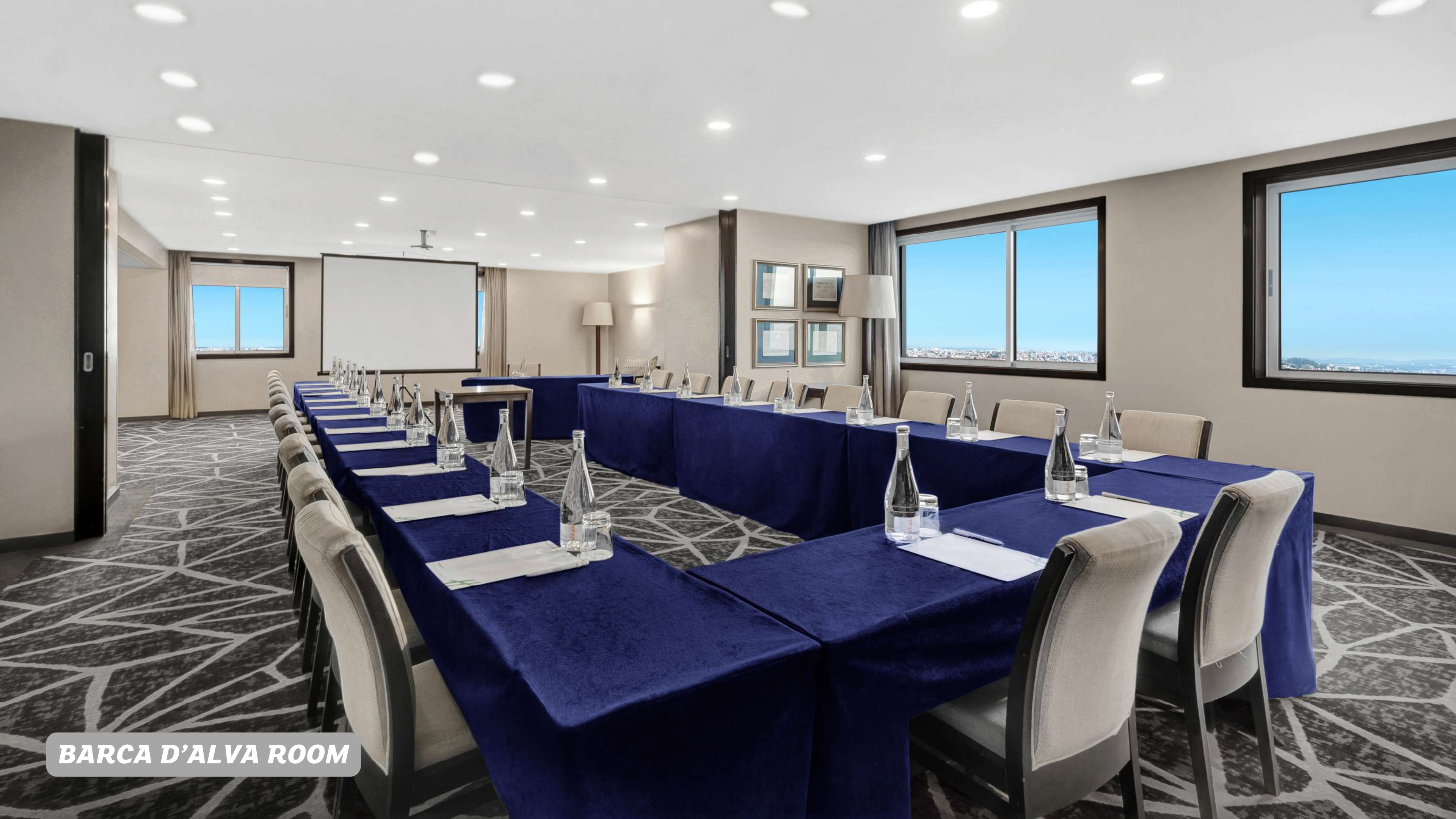
BARCA D'ALVA ROOM