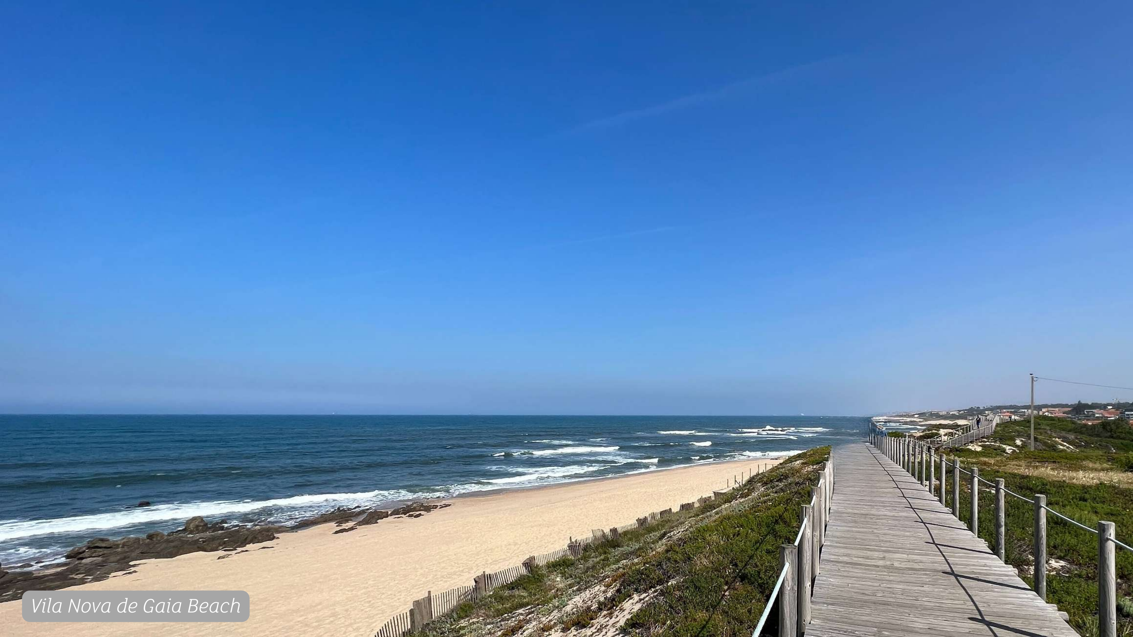
Vila Nova de Gaia Beach