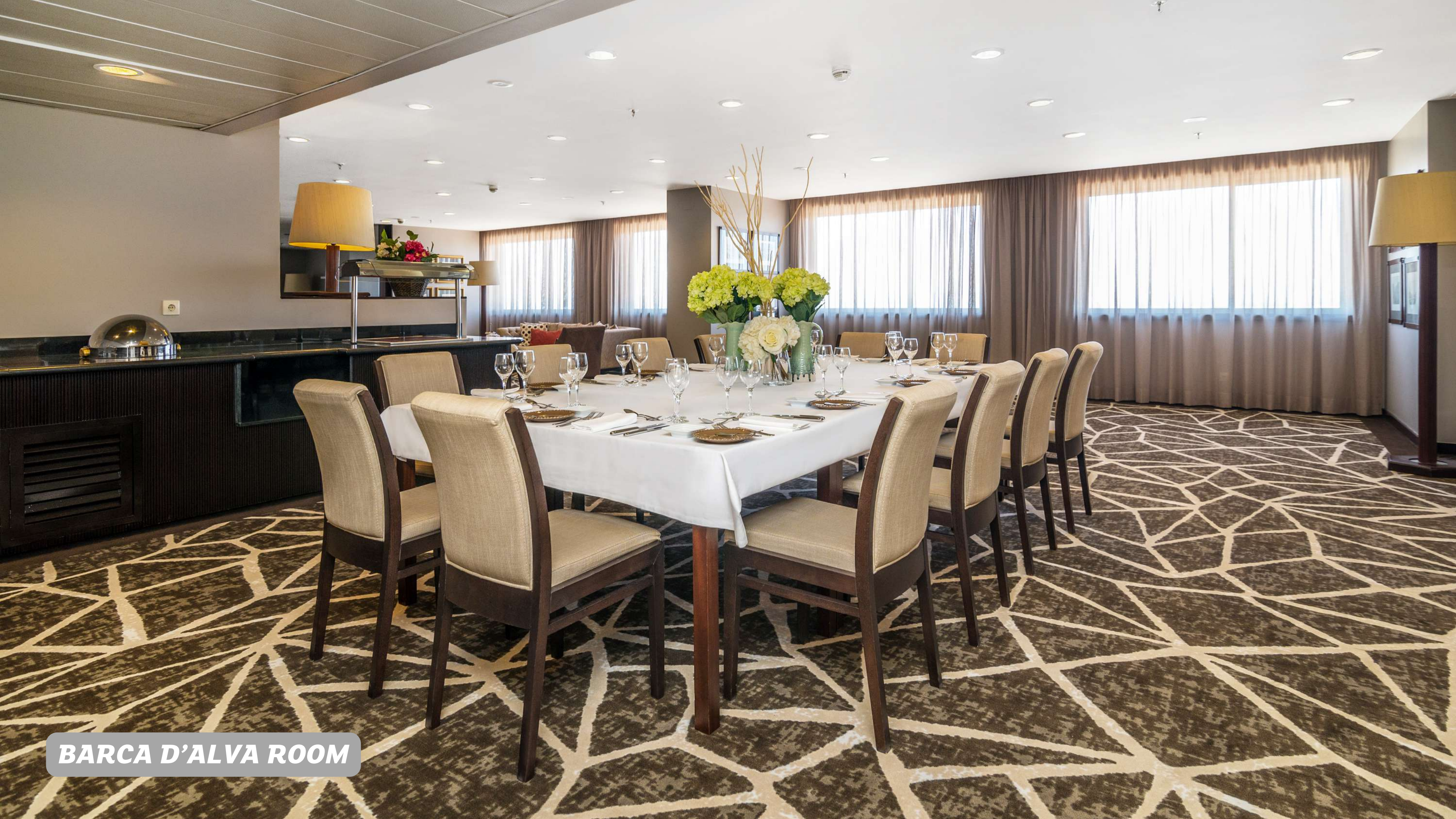
BARCA D'ALVA ROOM